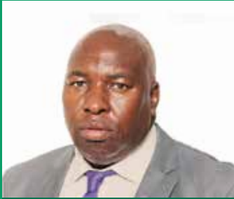
Council Speaker Cllr Kgwediebotse Chego