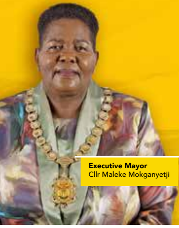
Executive Mayor Cllr Maleke Mokganyetji