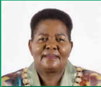
Executive Mayor Cllr Maleke Mokganyetji